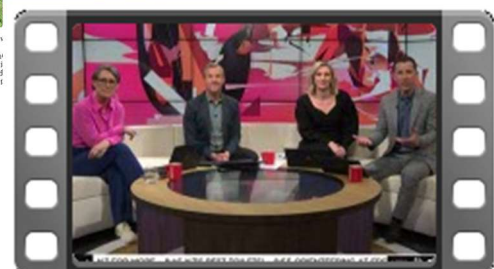
Breakfast TV features Orienteering